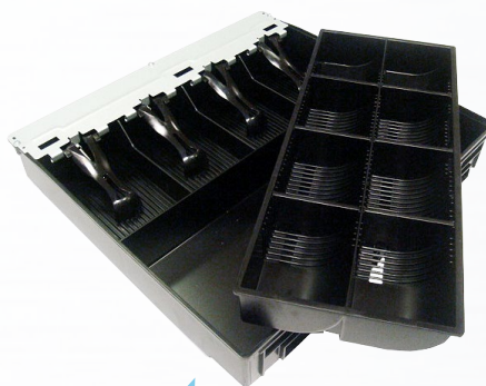
Removable coin tray