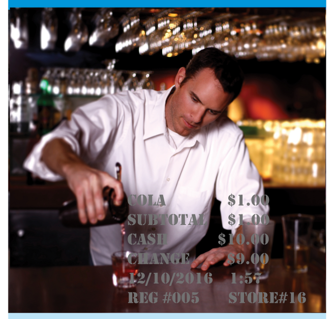
The picture above shows without a doubt that the Bartender has entered "Cola" @ $1.00 instead of a "Cocktail" @ $6:00